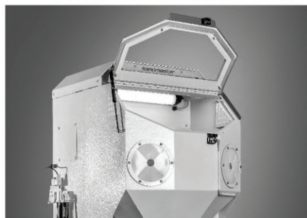
Front opening door

The dry injector blasting installation 60 IN offers a generous work space with extremely compact dimensions. Based on its proven «sandmaster» blasting system, the installation can be used flexibly